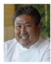
Alan Wong: The chef made the names of isle farmers part of the menu at the APEC event

"I'm always flattered when they ask," said Wong. "No. 1, it's an honor to do this not only for the president of the United States, but for the country. It's an honor to represent Hawaii."